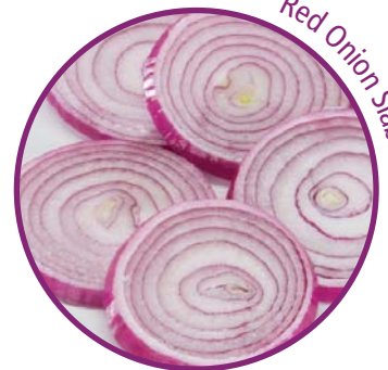
Red Onion Slabs