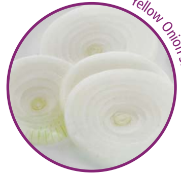
Yellow Onion Slabs