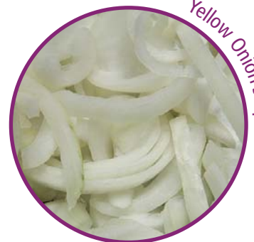
Yellow Onion Strips