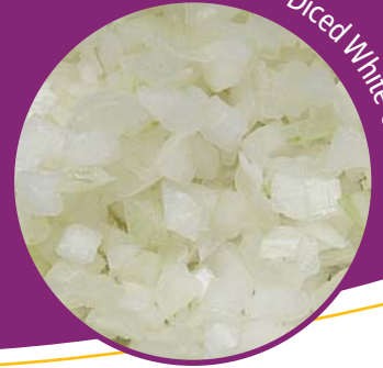
Diced White Onion